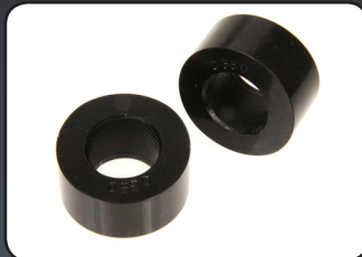
FRONT ANTI ROLL BAR MKII, III & ITAL