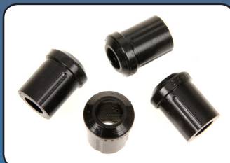
LEAF SPRING SHACKLE TO CHASSIS