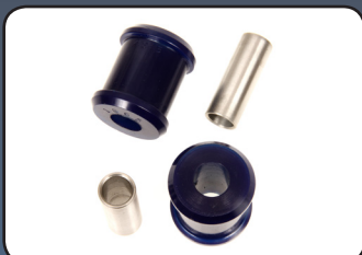
FRONT EYE BOLT ALL