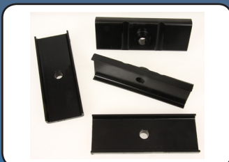
LEAF SPRING SADDLE PADS