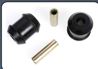
REAR ANTI ROLL BAR END LINK