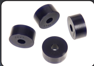
FRONT TIE BAR ALL

Steering Rack & Front Anti Roll Bar Bushes