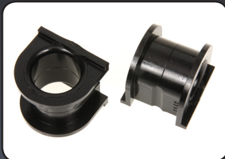
STEERING RACK MKII, III & ITAL