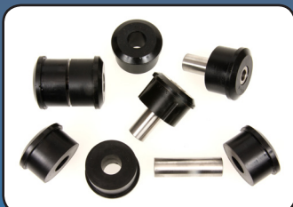
REAR LEAF SPRING EYES