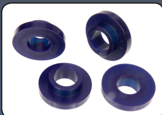
FRONT LEVER ARM SHOCKS EARLY